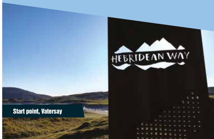
Start point, Watersay