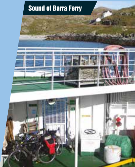
Sound of Barra Ferry

Soon after the turning for Balivanich is a museum, housed within the local school. You then reach the machair and the stunning beach at Culla Bay. From Balivanich, the route meets the main road once more.