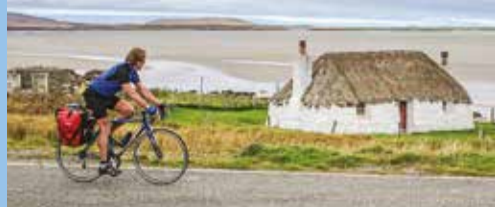
Malacleit, North Uist