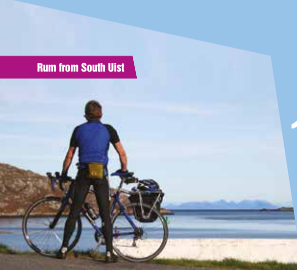
Rum from South Uist