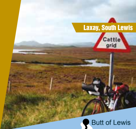
Laxay, South Lewis

Brothers David and Thomas Stevenson - of the famous "Lighthouse Stevensons" family - built the red-brick lighthouse that marks the end of the route in 1862. Thomas's son, Robert Louis Stevenson, wrote the novel 'Dr. Jekyll and Mr. Hyde'.